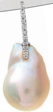
Earring OR336 White Gold Gold Weight gram 0.54 ct Diamonds 104 Stones Setted