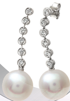
Earring OR331-B White Gold Gold Weight 0.45 gram 0.55 ct Diamonds 50 Stones Setted