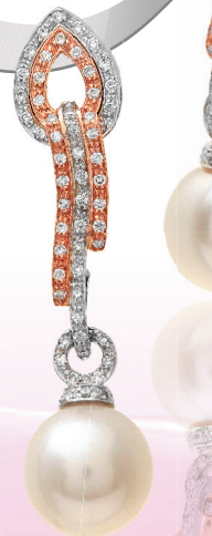
Earring OR664 White Gold Baroque Pearl Gold Weight 0.45 gram 0.12 ct Diamonds 24 Stones Setted