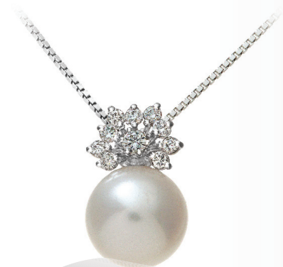
Pendant AP025 White Pearl Gold Weight 0.24 ct Diamonds 10 Stones Setted