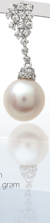
Earring OR331-B White Pearl 11mm Gold Weight 0.45 gram 0.55 ct Diamonds 50 Stones Setted