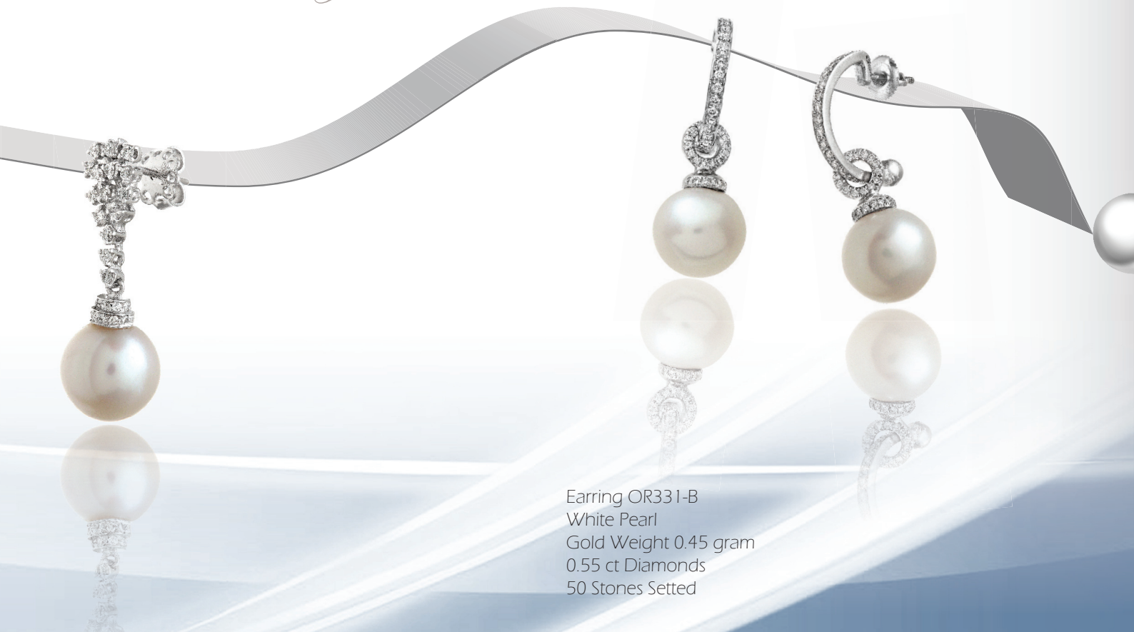
Earring OR331-B White Pearl Gold Weight 0.45 gram 0.55 ct Diamonds 50 Stones Setted