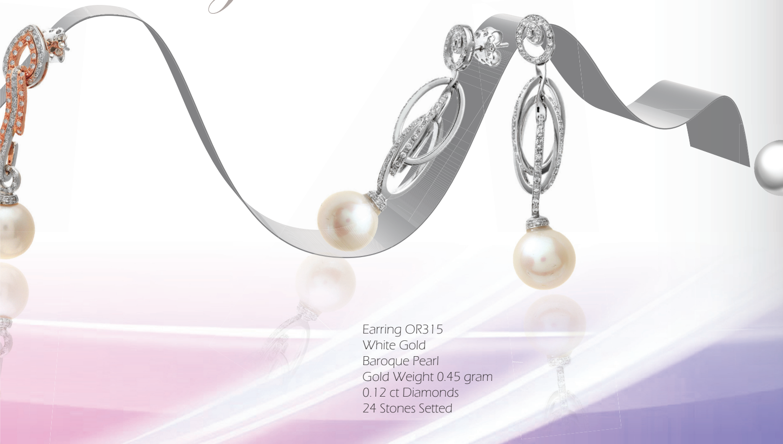
Earring OR315 White Gold Baroque Pearl Gold Weight 0.45 gram 0.12 ct Diamonds 24 Stones Setted