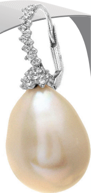
Earring OR367 White Gold Gold Weight gram 0.76 ct Diamonds 102 Stones Setted