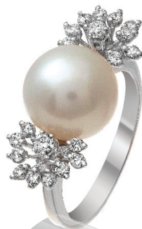
Ring AP025 White Pearl Gold Weight 4.20 gram 0.48 ct Diamonds 20 Stones Setted