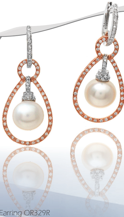
Earring OR329R White Pearl Gold Weight 0.45 gram 0.70 ct Diamonds 130 Stones Setted