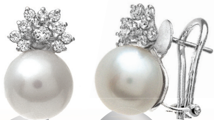
Earring OR333 White Pearl Gold Weight 0.48 ct Diamonds 20 Stones Setted