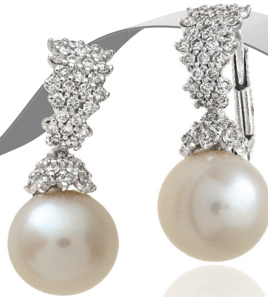
Earring OR335 White & Pink Gold Gold Weight gram 0.60 ct Diamonds 120 Stones Setted